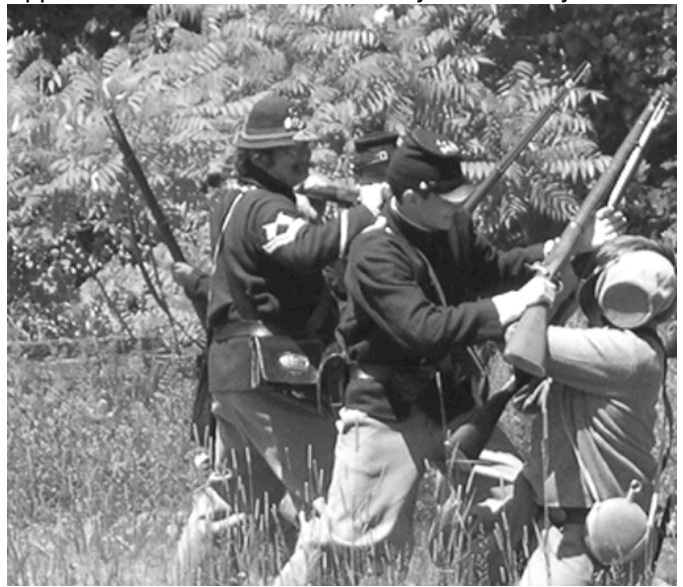
The 10th Mass. goes on the attack, saving our No. 10.