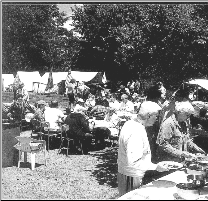
The hungry crowd attacks the food while the 10th Massachusetts stand guard in their encampment, wondering if there will be any leftovers. Fat chance!