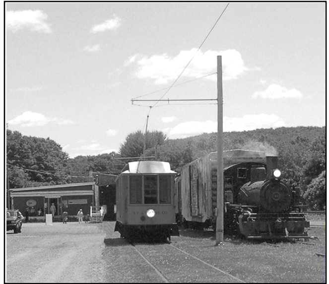
A race? Trolley No. 10 against steam No. 10? Actually, no, even though the steamer has its headlight on and lit and the old girl even has a fire in the firebox, giving the appearance of life at her stack. Maybe someday.....