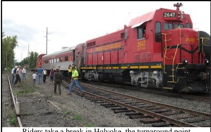
Riders take a break in Holyoke, the turnaround point of the trip.