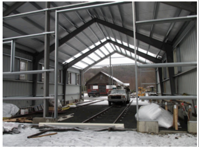
View from Inside

The carbarn has been painted to match the freight house as close as possible.