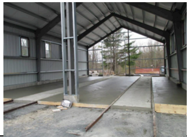
The floor – made of concrete.