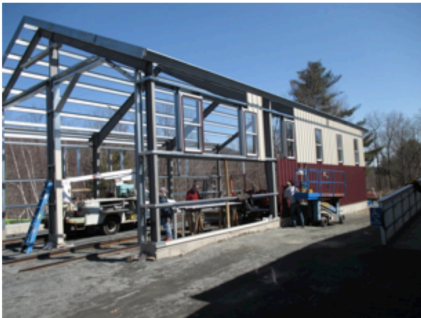
Siding starts being put on