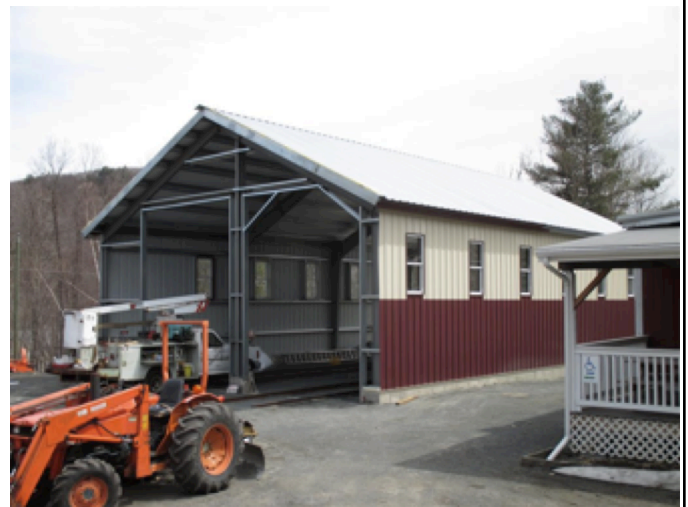
The siding and roof are completed