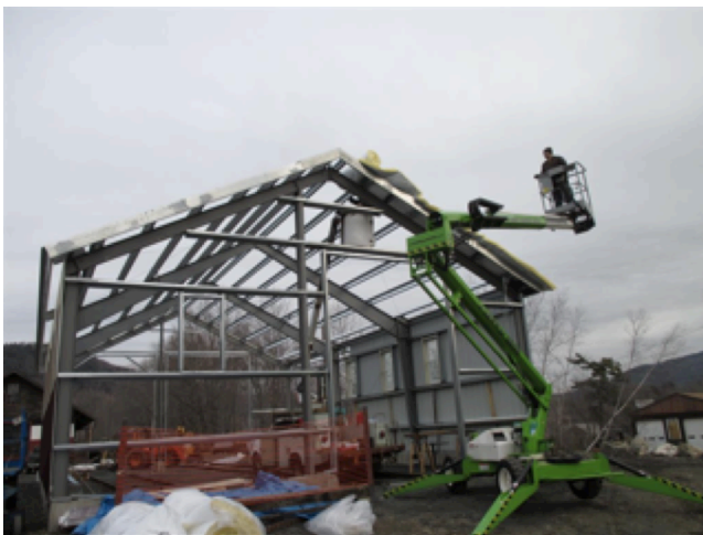
Insulation for the roof starts being put on