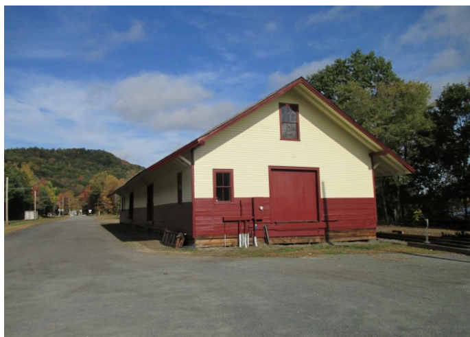
Exterior Restoration of the Freight House is complete!