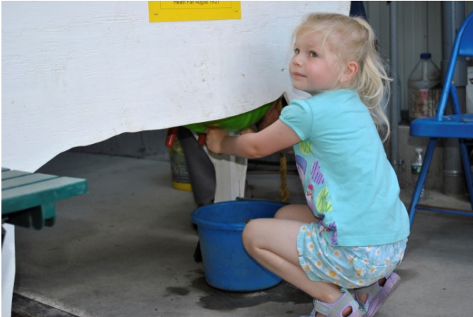
A young visitor tries her hand at milking the 'cow'.

Following the Car barn ceremony, we held our annual Trolleyfest. We had caboose rides on the House Track and motorcar rides on the South Track. In the new Car barn we had displays relating to industries and producers from the local trolley era (1896-1927). Hands-on activities included weaving, metal-working, buttermaking, cider-pressing, cow milking and uses of vinegar.