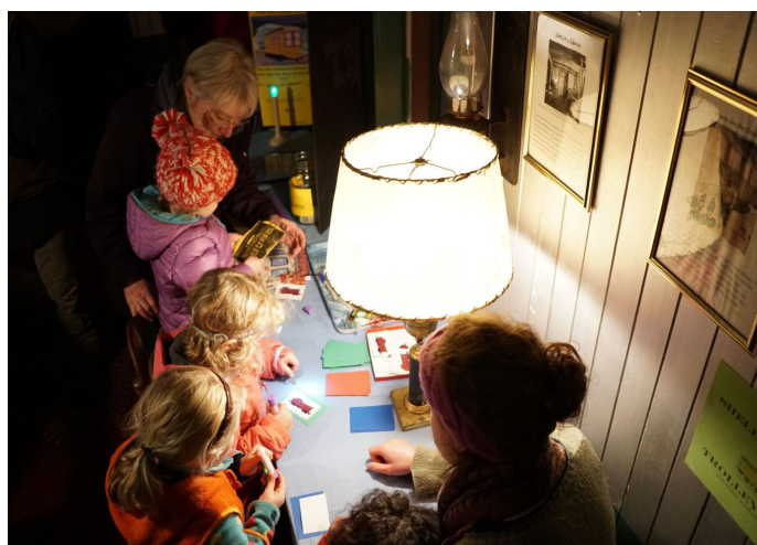
Making Caboose ornaments at Moonlight Magic

We have several collections of LGB and O-Scale toy trains for sale. Contact us if you would like more information, these would look great under your tree!