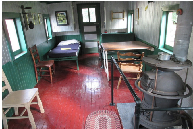
The floor color was taken from under the coach seats