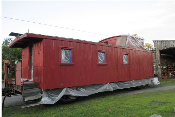
CV 4015 is ready for spray painting

ready for another season of excited visitors. For now the caboose is in the shed, a tight squeeze but safe from the winter elements.