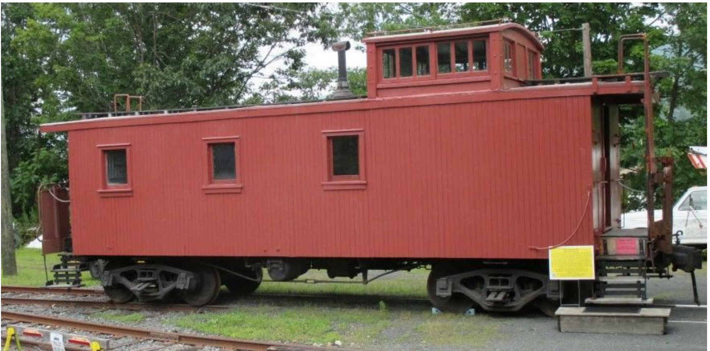
CV 4015 in her new paint awaits the next visit from museum guests

Our caboose has been on the property for as long as we've been giving trolley rides, eighteen years. See page 7 for the story of how we came to have a caboose. Some folks think a trolley museum shouldn't have a caboose (and some folks can't tell the difference, our crew help explain it to them). Our mission is a bit broader than our name, encompassing trolley and railroad preservation. This caboose, which ran through Palmer, Belchertown, Amherst, Millers Falls and Northfield (among other places) certainly qualifies as local railroad history.