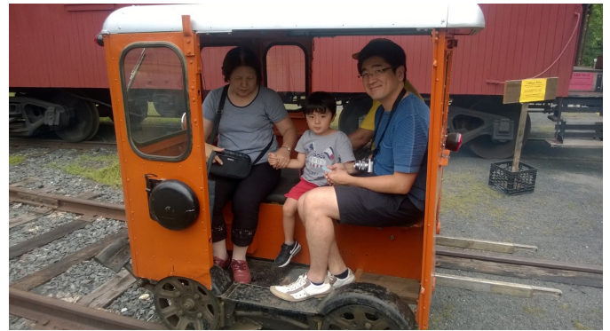
Speeder rides are always a hit

On July 22, we held our annual Trolleyfest. We had caboose rides and motor car rides on the House Track. In the Car Barn we had displays relating to industries and producers from the local trolley era (1896-1927). There were model railroad displays as well. A tag sale and a raffle added to the interest (and revenue!). In the yard we had farm displays and kids games from the 1890's. Hands-on activities included weaving, metal-casting, butter-making, cider-pressing, cow milking and uses of vinegar. Lunch was sandwiches and drinks inspired by what early 1900's farmers would have eaten in the fields.