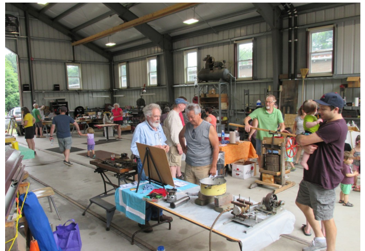
The Car Barn was full of activities

On the trolley rides we had re-enactors who were dressed as passengers from the trolley era and had conversations with each other and the passengers in their assigned roles as teacher, farmer, etc.