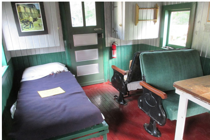
A close up of the bed and seats