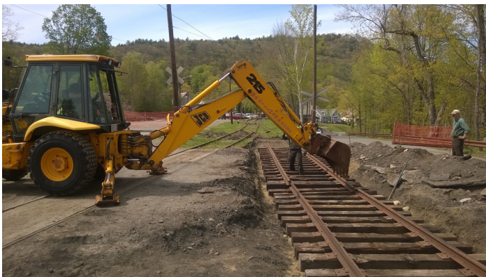
Hillman Bros backhoe tweaks the track alignment.