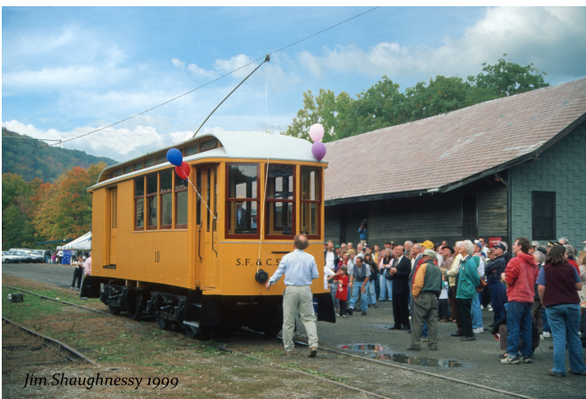
The pole goes up for the first time at Trolleyfest 1999