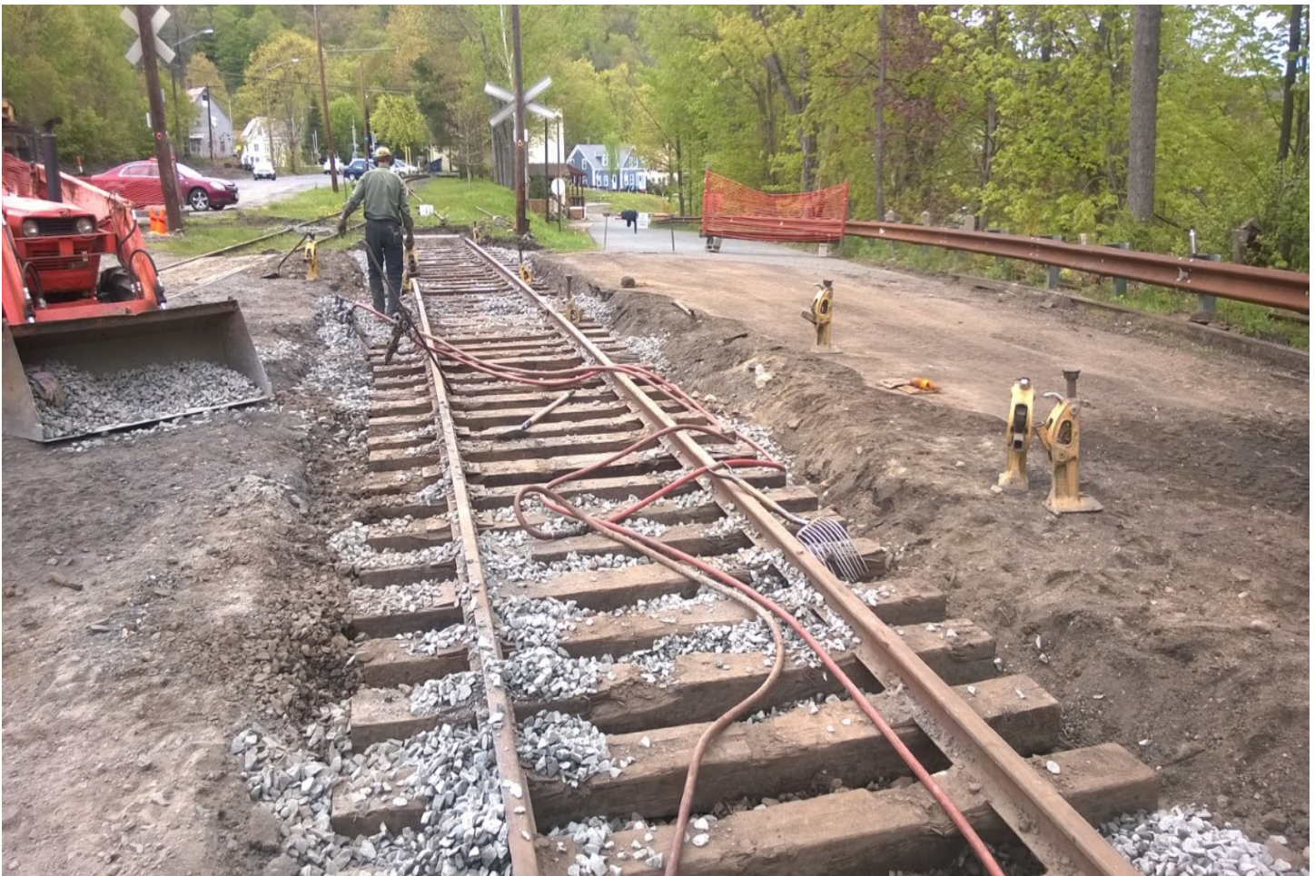
Nash prepares to jack the track into alignment in preparation for more ballast.

DEDICATED TO PRESERVING THE HISTORY OF THE SHELburnE FALLS AND COLRAIN STREET RAILWAY