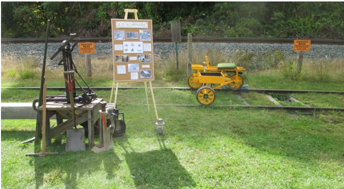
Josh's display of track tools for Trolleyfest

Caboose rides and speeder rides were available as well. The weather cooperated too. If you missed Trolleyfest this year, it will be back next year on September 28. Thanks to everyone who helped!