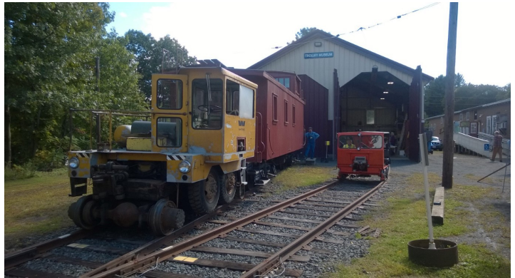
Ted's speeder awaits the next caboose ride departure

Be sure to renew your Membership to help support all our activities, and please donate to our Extend the Car Barn Project at http://www.sftm.org/grantmatch.shtml .