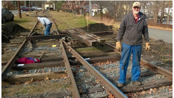
Nash and Dick replace switch timbers at TO2

Josh has disassembled the spare truck and will start cleaning and reassembling it when the weather improves.