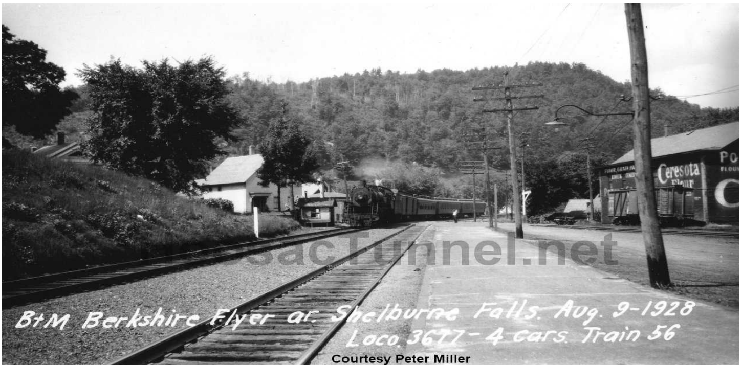
B+M Berkshire Flyer at Shelburne Falls. Aug. 9-1928 Loco. 3677 - 4 cars. Train 56